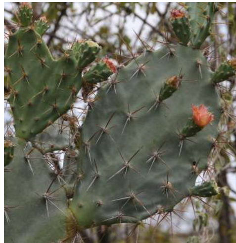
Tuna/ Tuna di baka (French prickly) Opuntia elatior