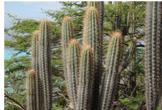
Kadushi di pushi (candle cactus) Pilosocereus lanuginosus