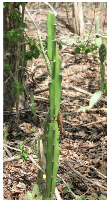
Kadushi di kolebra (snake cactus) Acanthocereus tetragonus

This sheet is for educational use and is not complete. Looking for other identification cards or in other languages? Please visit www.carmabi.org . Use 'Arnoldo's zakflora (A. van Proosdij)' for more information.