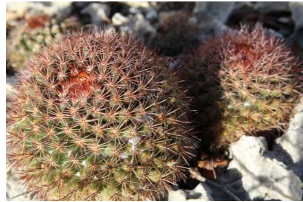
Bushito Mammillaria mammillaris