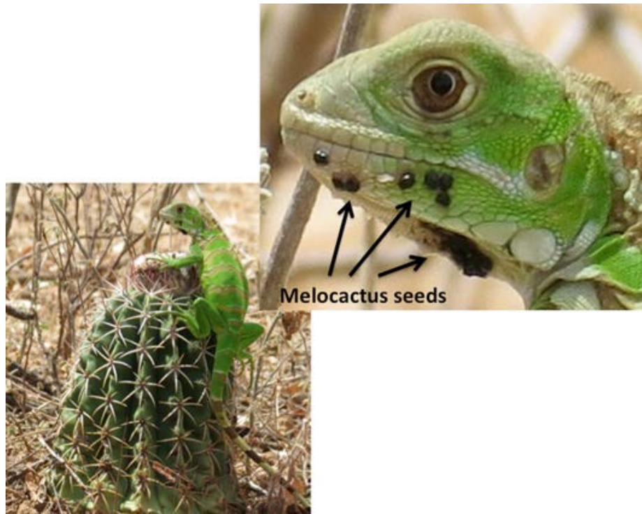
Figure 1. Picture taken on Tatacoa dry forest portraying a juvenile Iguana iguana that had just fed on Melocactus curvispinus fruits. A zoom of the iguana head shows how Melocactus seeds stuck to its snout.